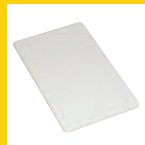
K2011 / D8239 / STCARD