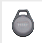
HID 1346 ProxKey III