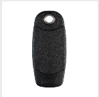
K2010 / D8238