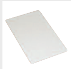
K2011 / D8239 / STCARD