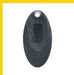
K3010 / D8338