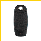
K2010 / D8238