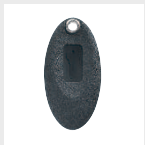
K3010 / D8338