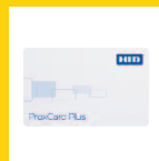
HID1386 ISOProx II Card