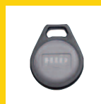
HID 1346 ProxKey III