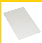
K3011 / D8339