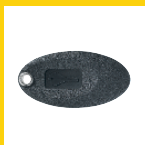
K3010 / D8338